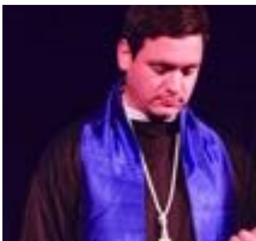
Dearly Beloved we are gathered here The Sermon