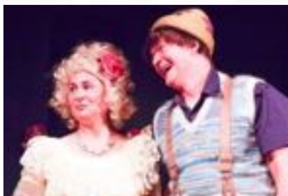
True Love shall prevail Only a Humble Gardener