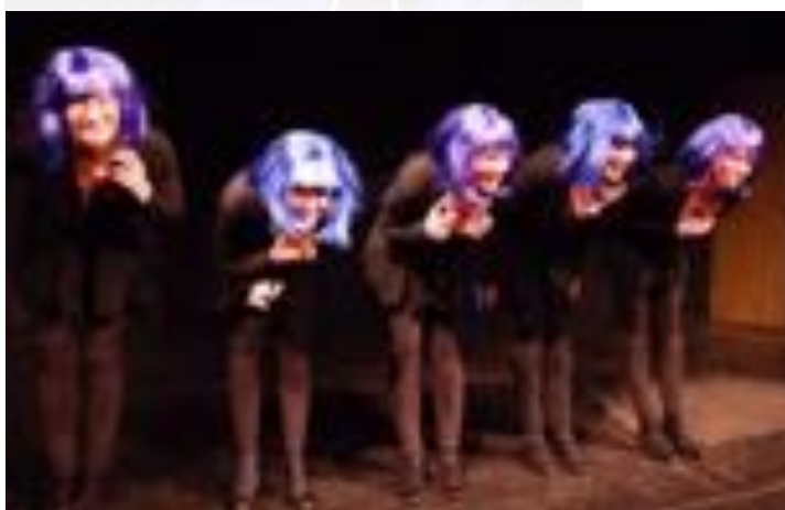
The who's who in Blue Same Same...but Same Same