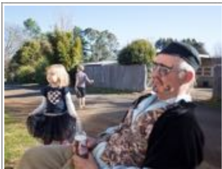
Relaxing after the show