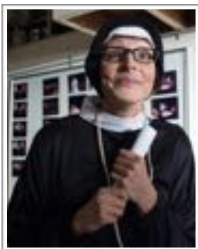
She couldn't Resist!