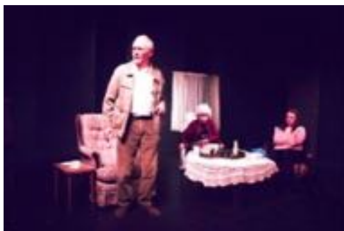
Let me just get the Map Say Something Happened