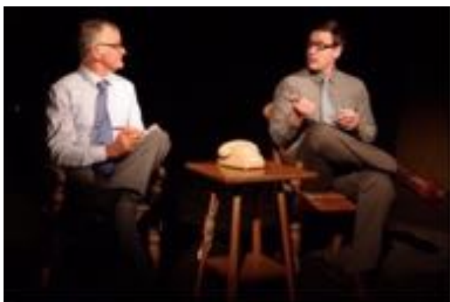
Now, what seems to be the problem? The Psychiatrist