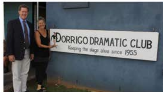
Federal Member for Cowper Luke Hartsuyker visits the Old Gazette Theatre which has received a federally-funded $18,000 upgrade.

Email us for further information: OldGazetteFilmSociety@gmail.com